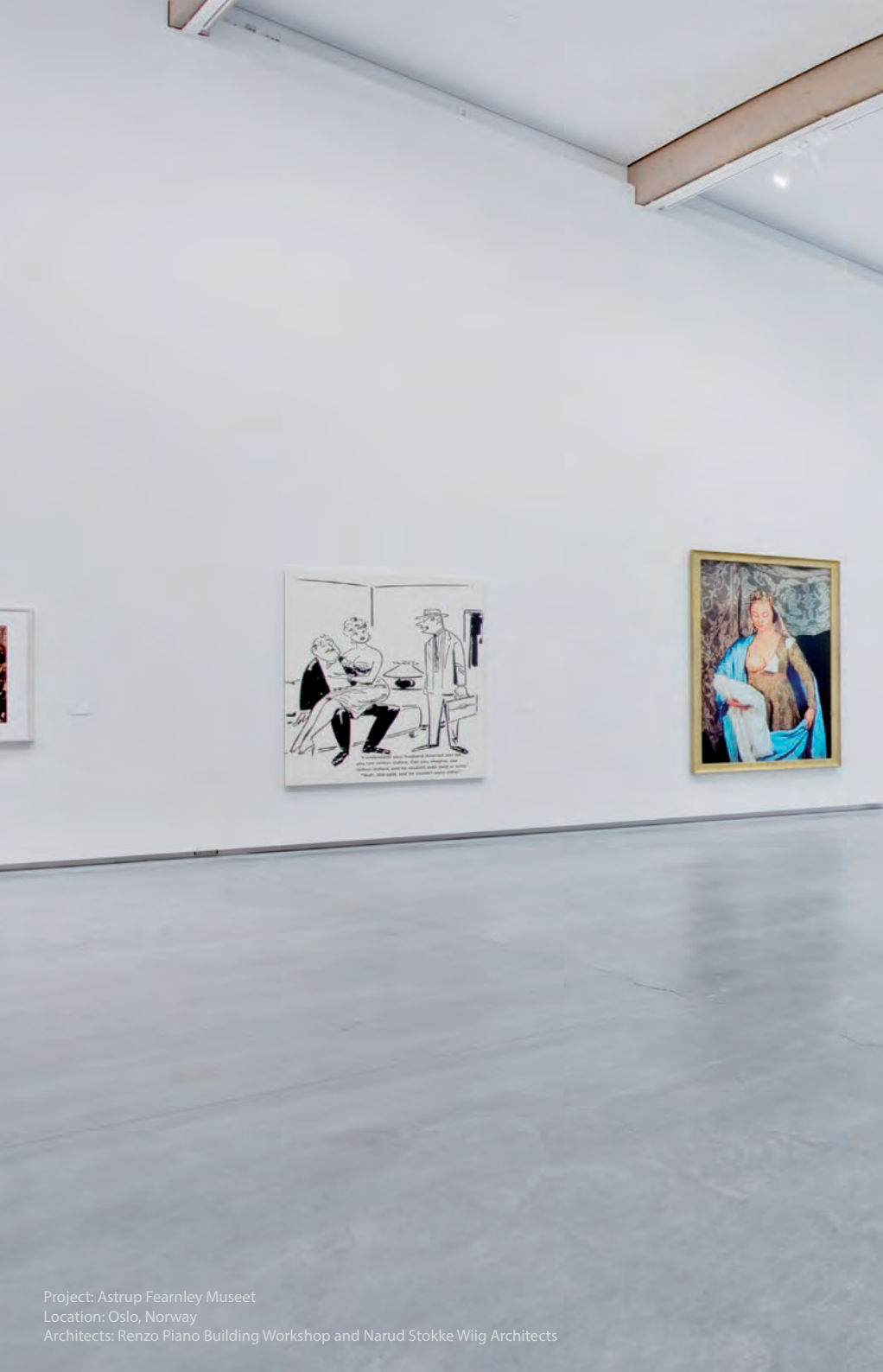
Project: Astrup Fearnley Museet Location: Oslo, Norway Architects: Renzo Piano Building Workshop and Narud Stokke Wiig Architects