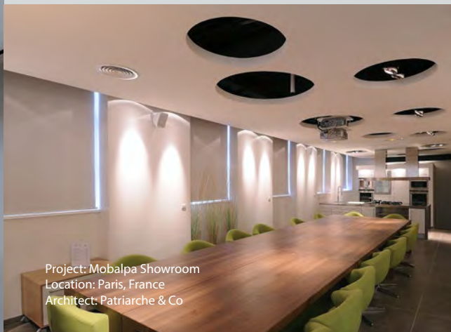
Project: Mobalpa Showroom Location: Paris, France Architect: Patriarche & Co

Available in white or bespoke colours, ROCKFON Mono Acoustic adapts to any space, both new builds and renovations. Its timeless, monolithic look complements the character and original architecture of historic buildings and makes Mono Acoustic an ideal choice for renovation projects. Equally suitable for new builds, it can be installed in large atriums or smaller rooms as seamless spans, ceiling islands and on walls. Offering total flexibility, Mono Acoustic can be shaped into concave, convex or S-shaped curves while allowing the incorporation of light wells, lighting, air-conditioning and ventilation systems as well as inspection hatches.