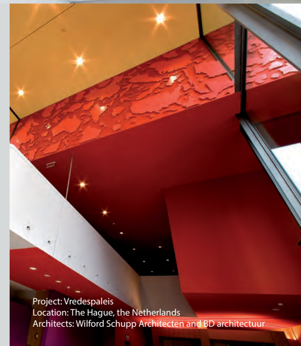
Project: Vredespaleis Location: The Hague, the Netherlands Architects: Wilford Schupp Architecten and BD architectuur

Ideal for any space, ROCKFON Mono Acoustic can be installed on a Chicago Metallic® suspension system or directly mounted on existing ceilings and walls. ROCKFON provides technical support and training courses for installers to ensure a high-quality finish and performance. Installation may only be completed by authorised Mono Acoustic installers who have successfully completed the training programme. Please contact ROCKFON for a list of authorised installers.